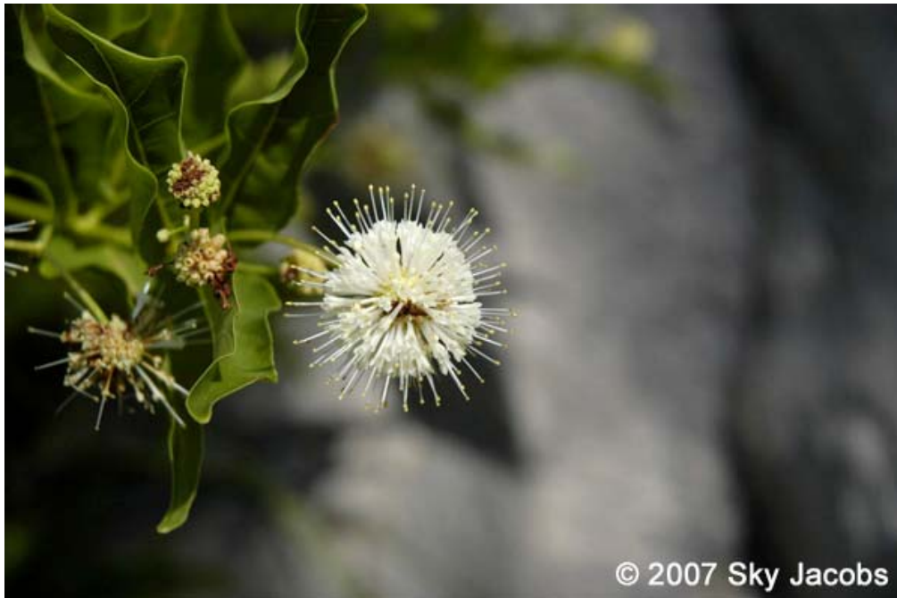
Figure 3: Button Willow ( Cephalanthus occidentalis var. angustifolius ) was common in Devil's Canyon.