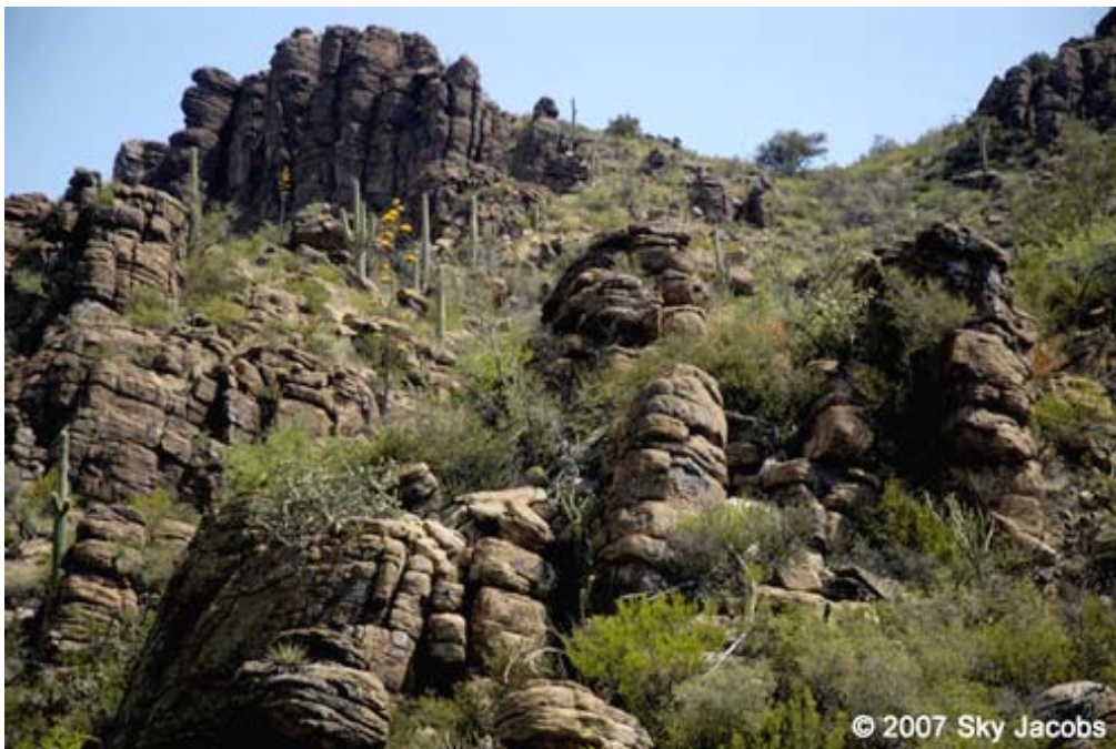
Figure 4: Typical upland vegetation in Devil's Canyon survey area.