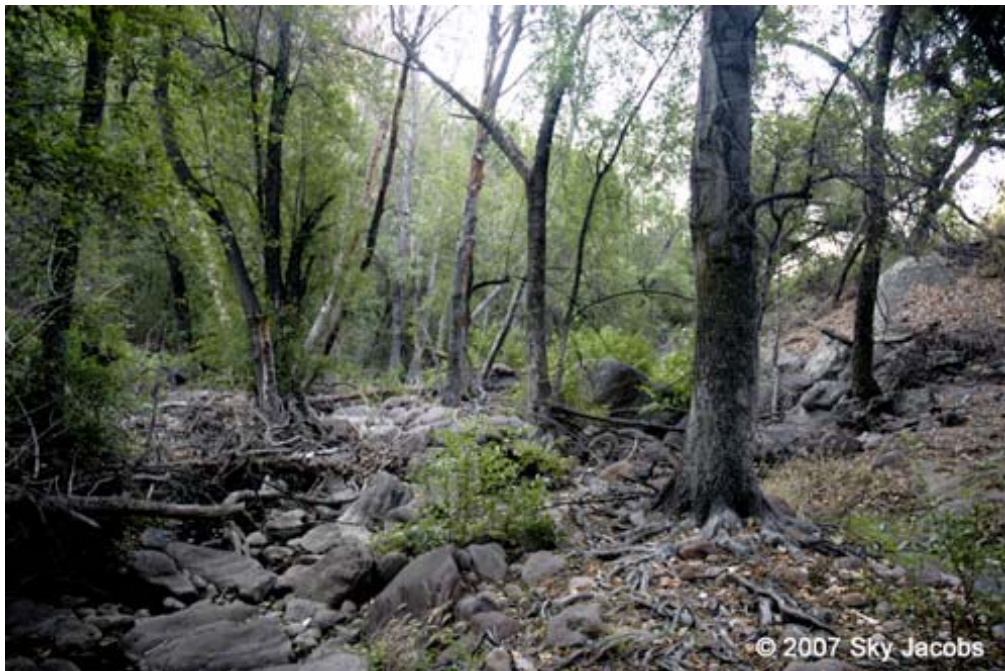
Figure 2: Typical Arizona Alder dominated riparian vegetation in the upper portion of Devil's Canyon.

Conclusion: Devil's Canyon is an impressive place. The surrounding countryside has stunning scenery and tremendous recreational values. The canyon itself supports well-developed riparian vegetation that is lush and provides a permanent source of water for wildlife. Devil's Canyon is an interesting transition zone that is influenced by Sonoran Desert, interior chaparral, as well as Madrean vegetation communities and vegetation association that is somewhat unique in Arizona.