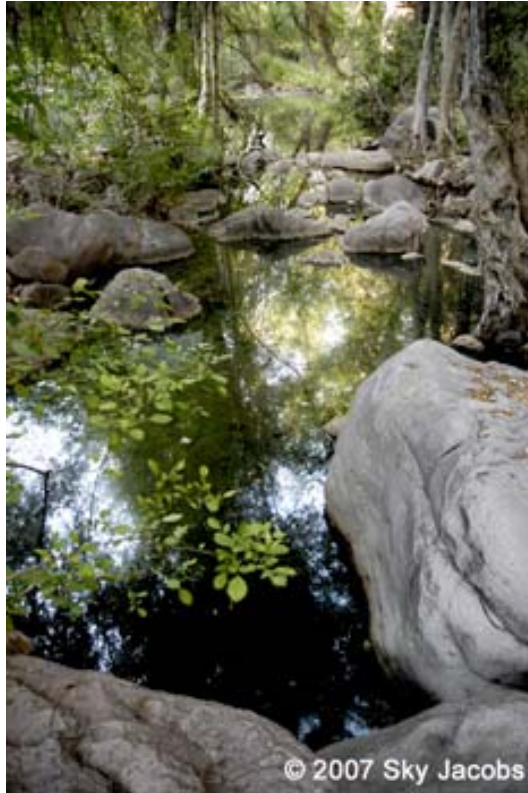
Figure 5: Surface water was present throughout much of Devil's Canyon.